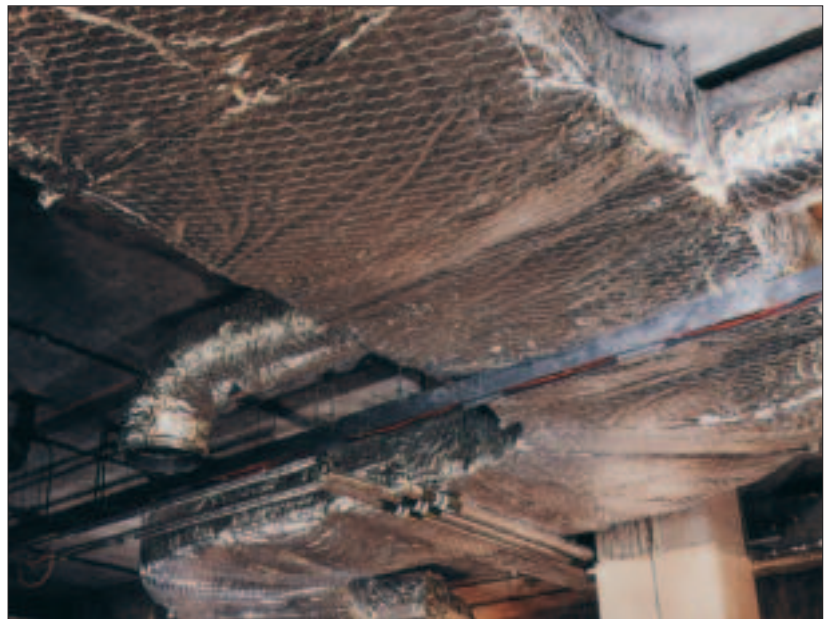
Rockwool Ductwrap used to thermally and acoustically insulate ducting

Ductwrap is a lightweight, flexible insulation roll faced with reinforced aluminium foil. Ductslab is a semi-rigid insulation slab faced with reinforced aluminium foil.